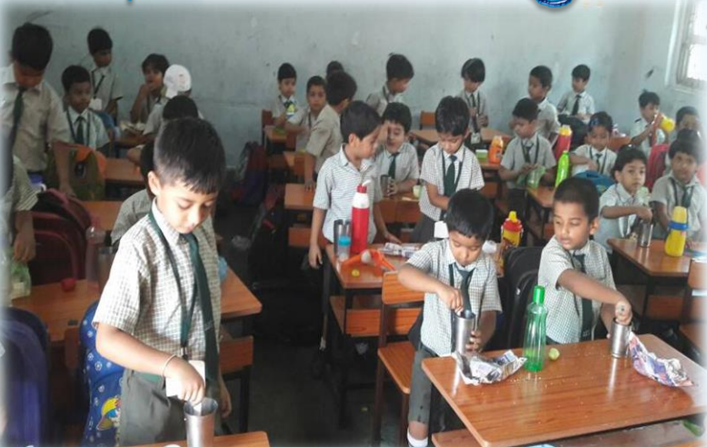
On the 21 <sup>st</sup> of April 2017 a Healthy Drink day was observed by the budding stars of Prep class who prepared lemonade – A healthy and nutritious drink, in their respective class rooms. The message highlighted was complete nutrition with proper intake of water.