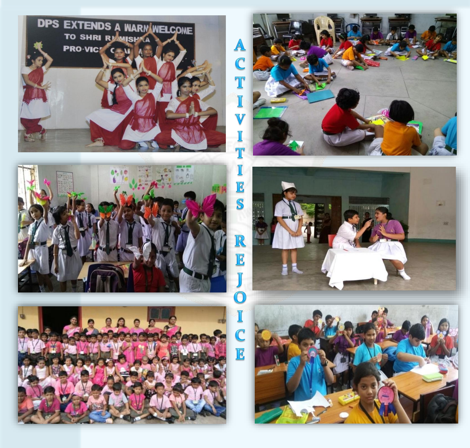
DELHI PUBLIC SCHOOL Nalco Nagar, Angul Odisha, School Affiliation No.:-1530018